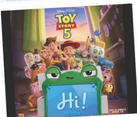
Toy Story 5