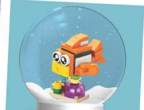
Fish are Friends!