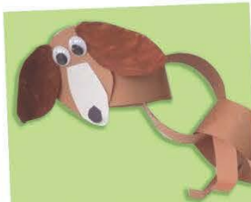
Animal Sidekick Safari